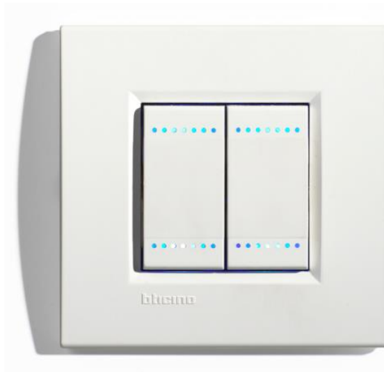
1 Bticino® SWC04/N LIGHT