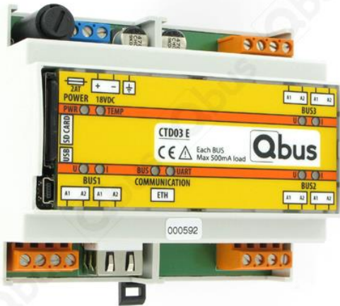
Figure 1 : Controller CTD03E