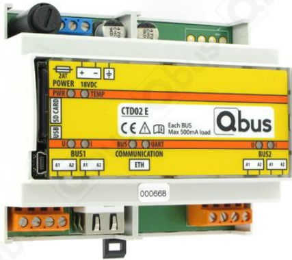
Figure 1 : Controller CTD02E