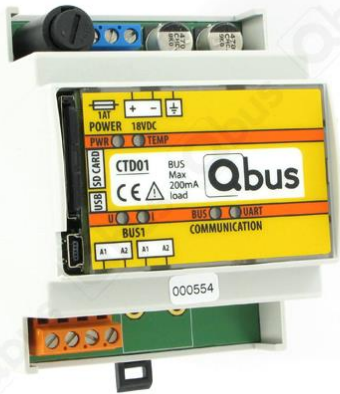
Figure 1 : Controller CTD01